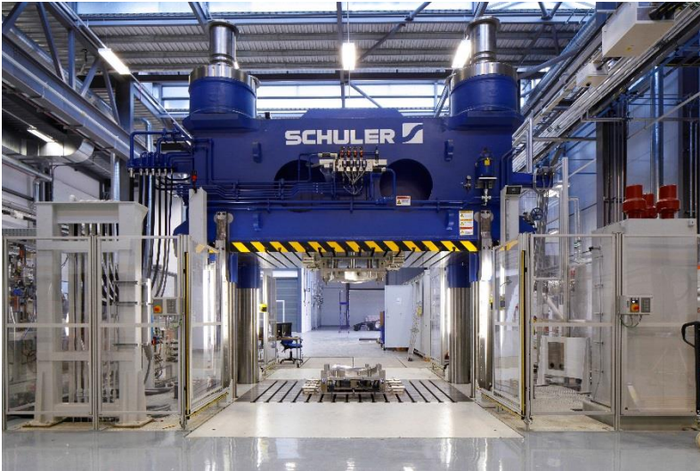
Picture 3: Large-scale industrial manufacturing equipment for SMC is also available in AZL's new research facility at RWTH Aachen Campus.