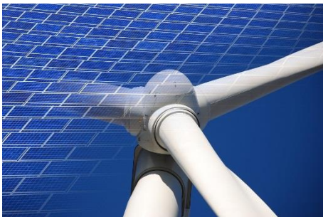
Picture 1: Energy storage systems are one of the key enabler for renewable energy requiring very diverse technologies. These are addressed in the study in order to analyze established, emerging and still developing systems and technologies.

http://azl-aachen-gmbh.de/wp-content/uploads/2017/09/3_Pictures_Energy-Storage_AZL.zip