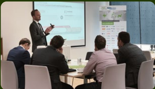
Networking and Showcase for your Company in 6 Workgroups