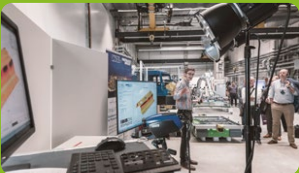
Access to Pool of Infrastructure, Experts and Talents