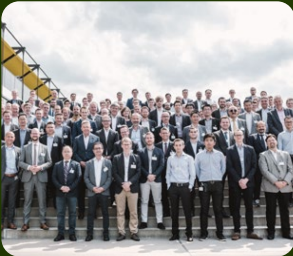
Annual Partner Meeting