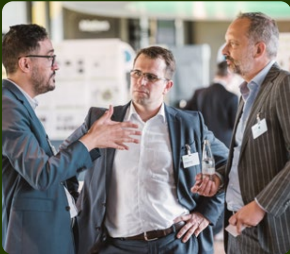
Connecting and Matchmaking at Networking Events and through Individual Contact Matching