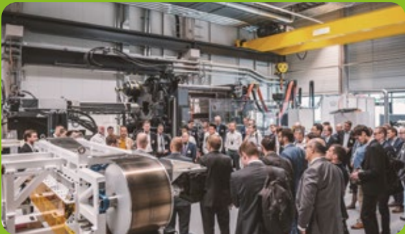
(Joint) Technology Development through Cost-Sharing