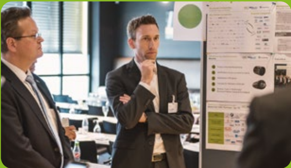
Individual Market Analyses, Technology Monitoring and Product Cost Benchmarks

bilateral and multilateral collaboration. Benefit from the many years of practical experience of AZL experts and discover the potential of your own ideas in a unique multiplier network.