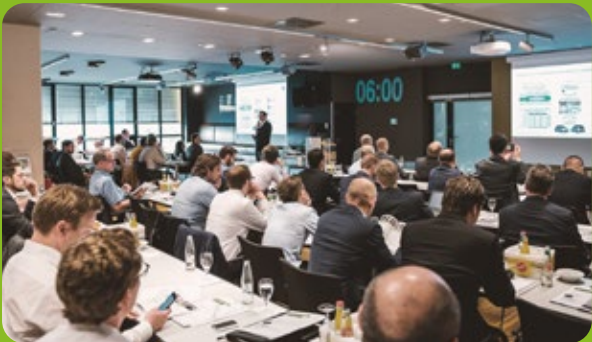
Showcasing & Visibility