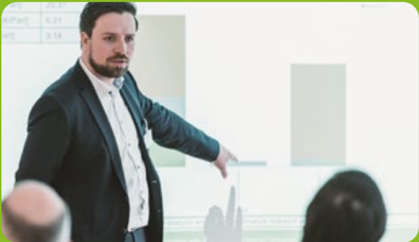
Market & Technology Intelligence