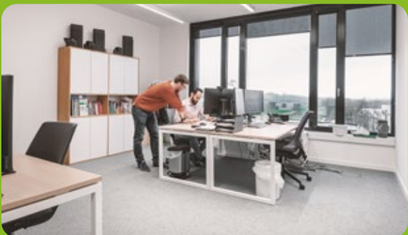
On-Campus Community Offices