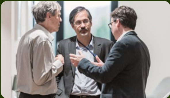
International Networking through regular Meetings