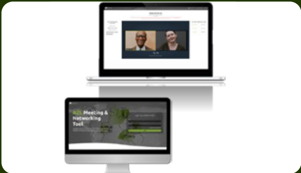
Access to AZL Platform with >800 Industry Contacts