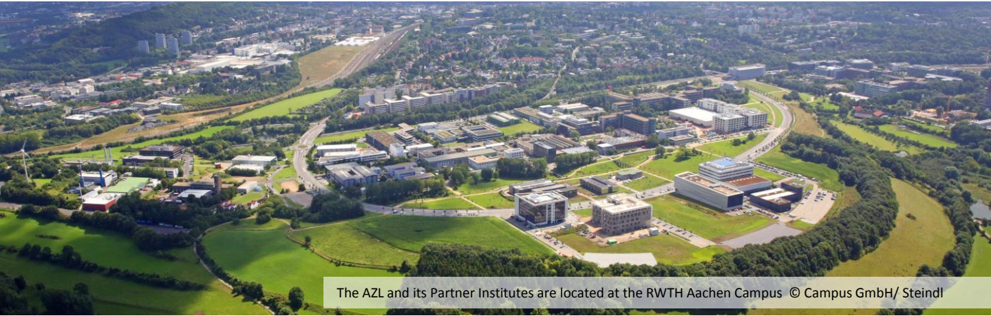
The AZL and its Partner Institutes are located at the RWTH Aachen Campus