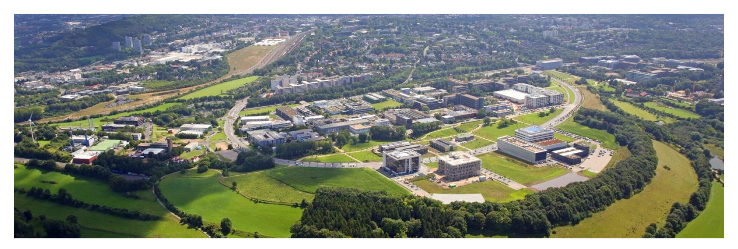
Picture 2: Competences and hardware along the entire SMC process chain are represented at the RWTH Aachen Campus.