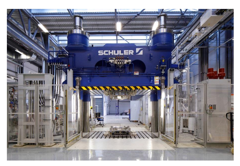
Picture 3: Large-scale industrial manufacturing equipment for SMC is also available in AZL's new research facility at RWTH Aachen Campus.