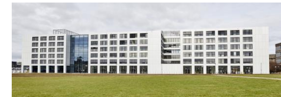
Home of AZL in the Production Engineering Cluster at the RWTH Aachen Campus