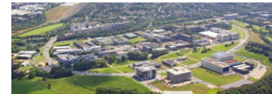
Competences along the entire SMC process chain are represented at the RWTH Aachen Campus.