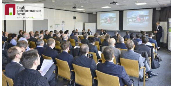
Kick-Off of AZL's Workgroup "High-Performance-SMC" with more than 60 participants

The project has been inspired by an international network of innovative companies shaping the future of HP-SMC